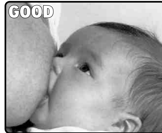
Image from the brochure of Breastfeeding from the Health Council of Andalusia.

The baby places his mouth around the nipple and most of the areola.