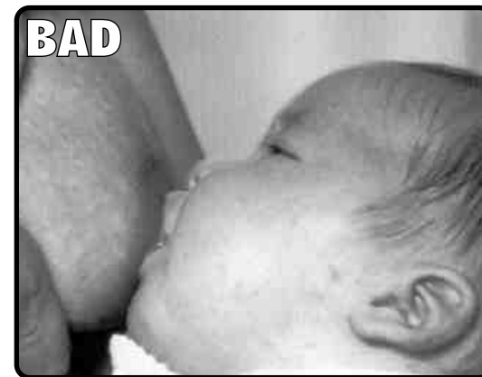
The baby only latches to the nipple.

Brochure made by Via Lactea to celebrate the World Breastfeeding week 2003. We would like this way to welcome all mothers coming to Aragón from other countries.